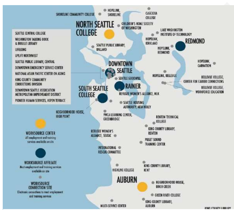
Figure 1. WorkSource centers, affiliates, and connection sites as of 1/29/24.

To accomplish these purposes, the One-Stop Operator is comprised of a team that includes an Integrated Service Delivery Director, a Training and Curriculum Coordinator, and an Outreach Coordinator. This team provides critical management and coordination for the entire regional One-Stop system.